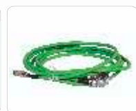
Resolver/Encoder Feedback Cable