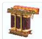
AC Input Choke