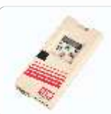
Std Display Operator with Keypad

With expertise gained over 65 years in the design, manufacture and application of motors, Bharat Bijlee - in partnership with KEB of Germany - has expanded its portfolio with a comprehensive range of AC variable speed drives and servo drive systems.